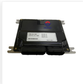
3 EXCAVATOR SPARE PART PC200-8 PC220-8 PC270-8 CONTROLLER 7835-46-1007