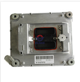
2 EC210BLC PRIME EC210B EXCAVATOR ENGINE CONTROL BOX D6E ENGINE EECU 60100000 FOR EXCAVATOR EC210 PARTS