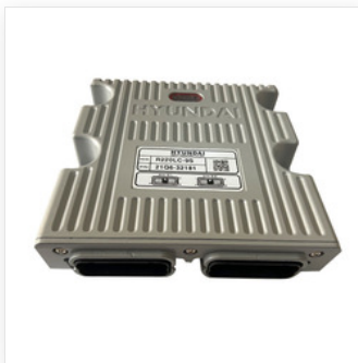
1 R220LC-9S EXCAVATOR CONTROLLER FOR EXCAVATOR CONTROL PANEL